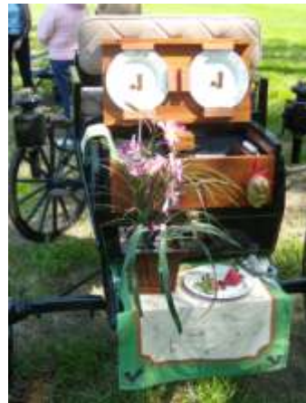
Connie and Linda Evans organized the very successful tailgate party and with the help of Whips volunteers served over 100 BBQ sandwiches.