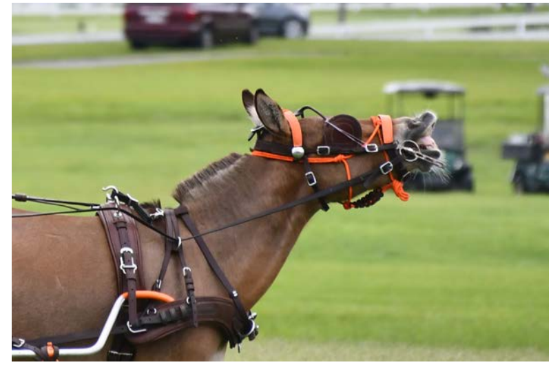
Someone has opinions about dressage. Me too, little man, me too...