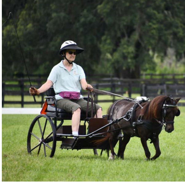
THAT'S ALL FOLKS!

This is our last issue until September... That issue will be a DOG DAYS issue! So it's time to get out the camera and pose with your pups (or cats) on or with the carriage. I'll be looking for a cover dog picture (hint, those work out best when they can be cropped 3:4 or square). I'll put out a "formal" call for pictures in August, but for now, it's time to take your best HIGH RESOLUTION dog & carriage pictures!