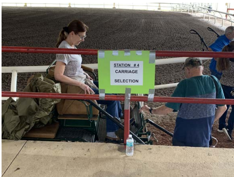
Checking out a marathon carriage