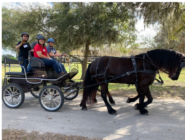
Translating the classroom to the real deal!