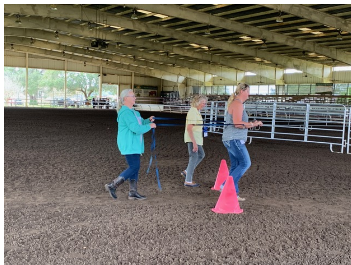
ground driving that I might be able to keep up with