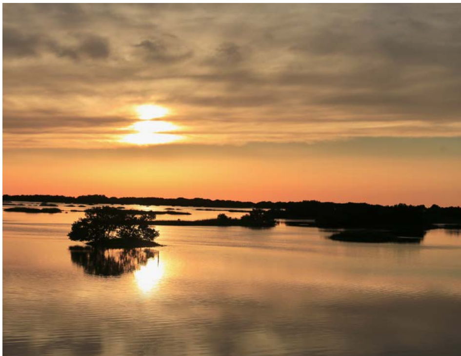
Dusk at Cedar Key