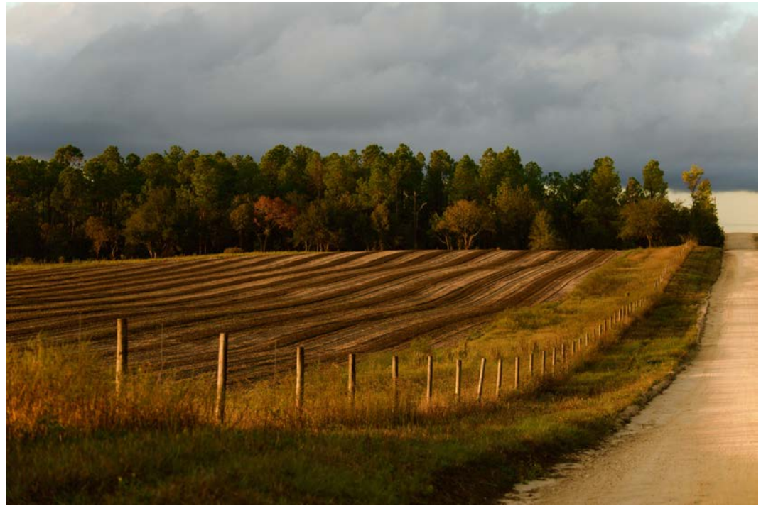
Crop Field Before a Storm

Going to the various nearby competitions (Nature Coast, Grand Oaks, Live Oak, Little Everglades) provided numerous chances for me to see and learn more about the driving horse in action. I started taking more and more pictures, always with the intent to capture the artistic viewpoint with light, color and motion. I have been urged by friends to submit some of my photos for publication in “The Whip” and “Driving Digest”. Others have requested prints be made. For the most part, I share my photography with the world through Instagram and Facebook. Everyone is invited to follow my social media as my camera is always with me.