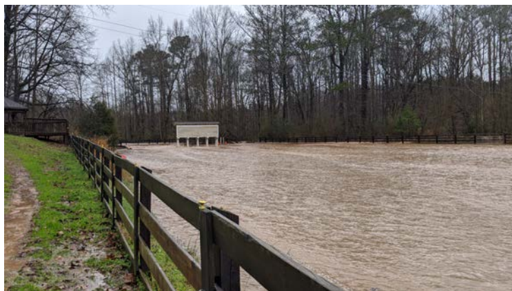
The artist formerly known as an arena

Take for instance, the week before I left for Spring Fling. It was a week I thought I was going to fine tune a dressage test and work on my my nemesis, cones. Then I would drive down to Florida feeling ready for anything. Instead, I got treated to a flash flood that destroyed the arena and dumped I don't know how much debris in the lower field (also, it should be noted that some of my arena footing is in that field as well). Then, not 48 hours later, it was all covered with a blanket of snow (which was gone in 10 hours when the $*# rain