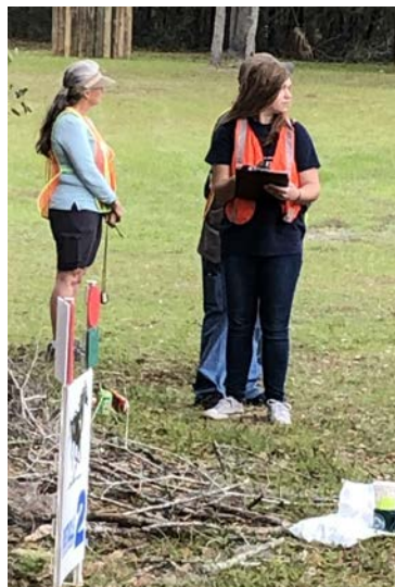
Volunteers working hard at Nature Coast