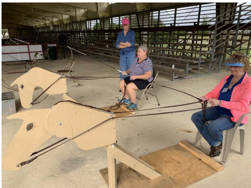
Rein boards in action