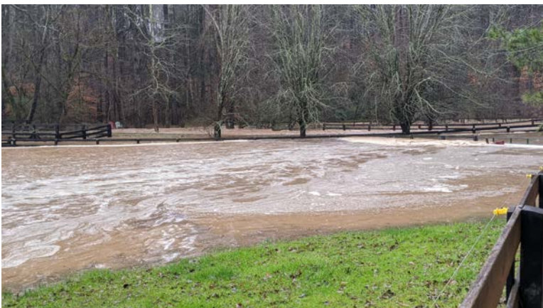
That black line at the top of the water is the top of 4 board fencing... Also, for comic relief, there's a mounting block bobbing along on the waves