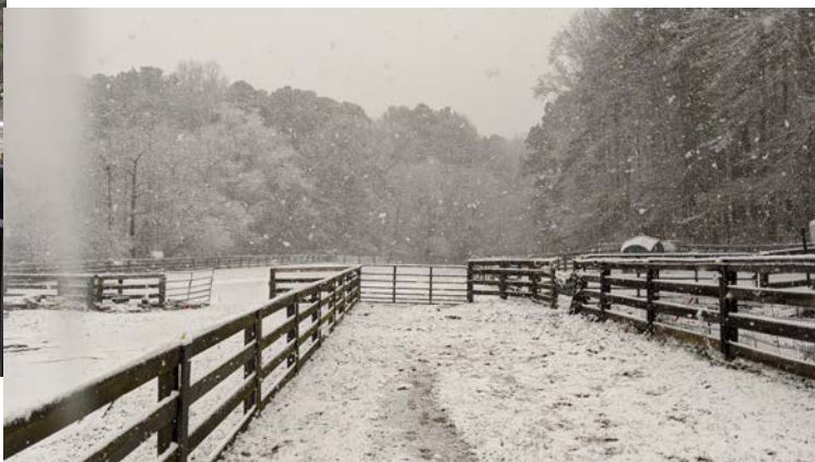
48 hours later! I mean this was bad even for Georgia...

You know how when you are stressed you do Stupid Things? With credit to Spinal Tap, my stress dial was at 11 by now.